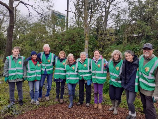
Greening Arundel are part of the network